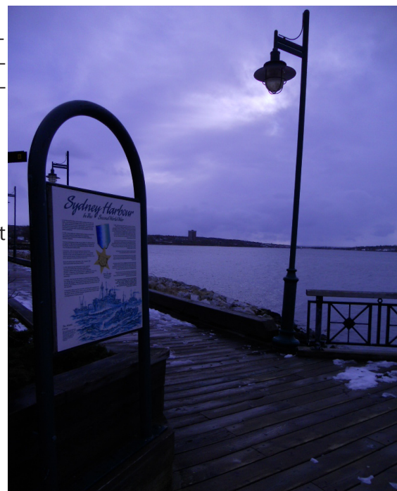
Picture of the Sydney Harbor in Canada

This has been such a unique opportunity for me, because I won't have this opportunity again for a long time (financially speaking). I learned about NSE through my home university's study abroad coordinator. She told me about how financial aid can make the trip financially plausible, while not adding a whole lot to my total college debt.